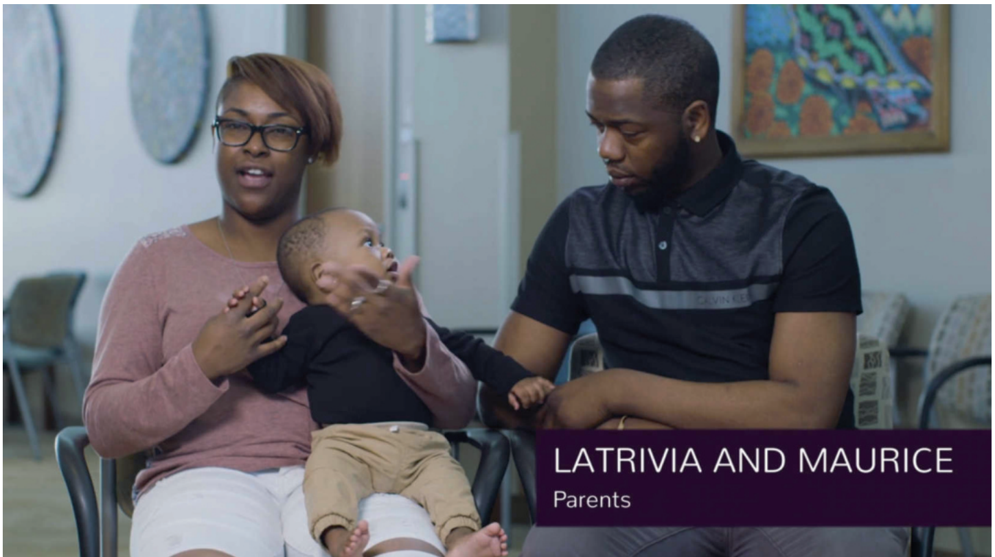
The Circumcision Movie. 36 mins., Emily2 Productions/The Midwife Media, 2019

hear alternative Jewish voices discussing the non-cutting Brit Shalom ceremony or to see scenes from such ceremonies, like those I included in Whose Body, Whose Rights?